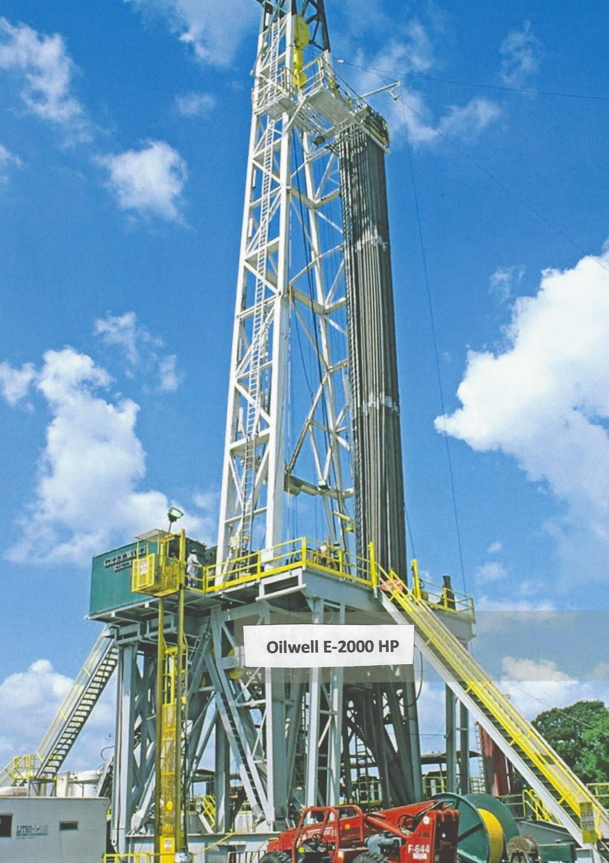
Oilwell E-2000 HP