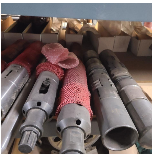
Inconel Tools: (6) 3.81 R Lock plugs and (2) R Running Tools