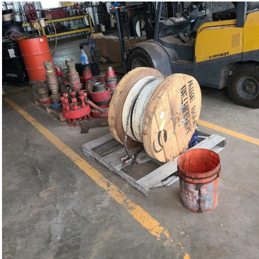
4 spools, 25,000' .108 ply steel wire