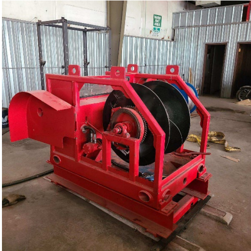
Hydraulic Slickline Wire Spooler