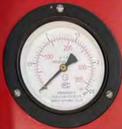
AIR SUPPLY PRESSURE